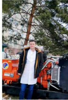
Perinatal center, Sumy